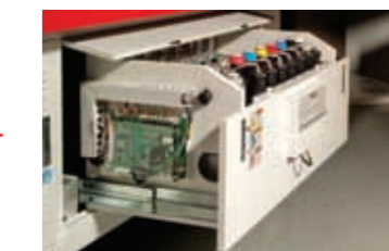
Ink control tray