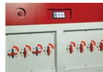
Switches to activate either of the 8 vacuum compartments