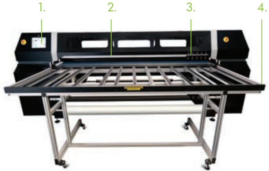
Shown with standard roller table