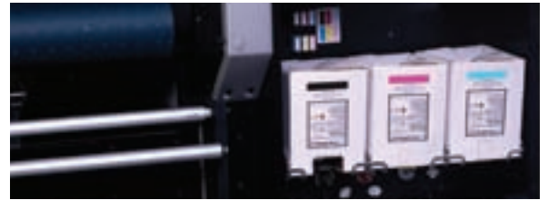
HP Scitex FB250 3-litre ink boxes – for long print runs