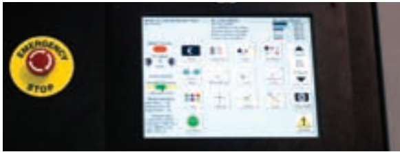
Detail of HP Scitex FB950 touchscreen and control panel